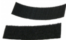
Hook & Loop Mounting Strip 1592ETV