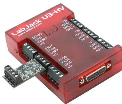
Figure 2: LJTick-DAC With U3

The LJTick-DAC (LJTDAC) is an analog output expansion module. It provides a pair of 14-bit analog outputs with a range of \pm 10 volts. The 4-pin design plugs into any of the standard DIO/DIO/GND/VS screw terminal blocks on the LabJack, and thus up to 10 of these can be used per device to add 20 analog outputs.