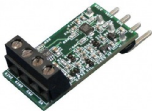
Figure 1: LJTick-DAC