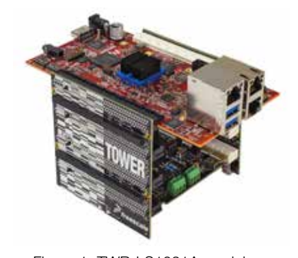
Figure 1. TWR-LS1021A module (TWR-LS1021A, TWR-SER-IO and TWR-ELEV)