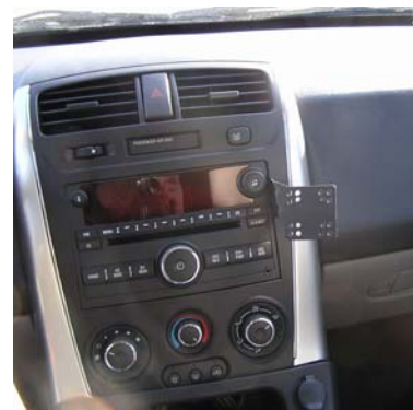
Saturn Vue 2006 Final Installation Picture

STEP #4: Replace the bezel carefully starting from the right side by the Installed Mount. INSTALLATION IS NOW COMPLETE. ENJOY YOUR NEW INDASH by PANAVISE MOUNT.