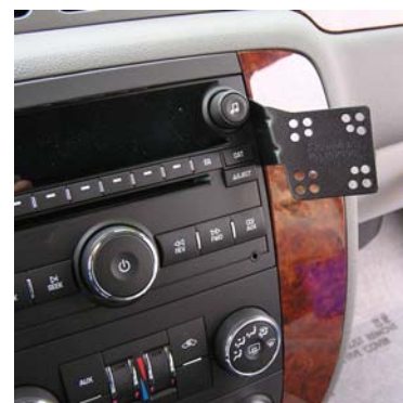
Chevy Tahoe, Suburban 2007

INSTALLATION IS NOW COMPLETE. ENJOY YOUR NEW INDASH by PANAVISE MOUNT.