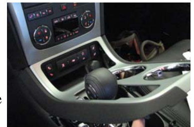
Shifter Console Removal

STEP #1: Start by removing the bezel that surrounds the shifter and cup holder but does not include the cup holders.. Using the Hook/ Dash tool in the right rear corner of the bezel pull to release (2) clips. Continue lifting up from the rear of the bezel tilting up until the THIN strip releases above the climate control and the three (3) plastic tabs release from under the radio bezel. Lift the bezel over the shifter and set aside.