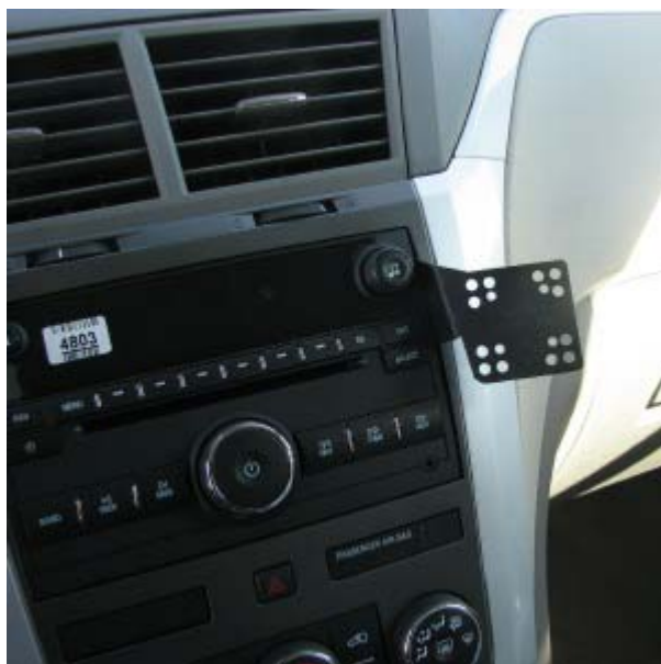
Installation of InDash Mount

INSTALLATION IS NOW COMPLETE ENJOY YOUR NEW INDASH by PANAVISE MOUNT