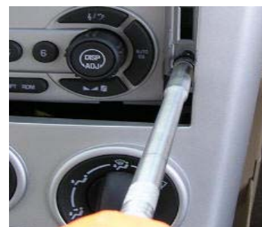
Lower Installation Location screw removal