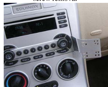
Lower Installation Location