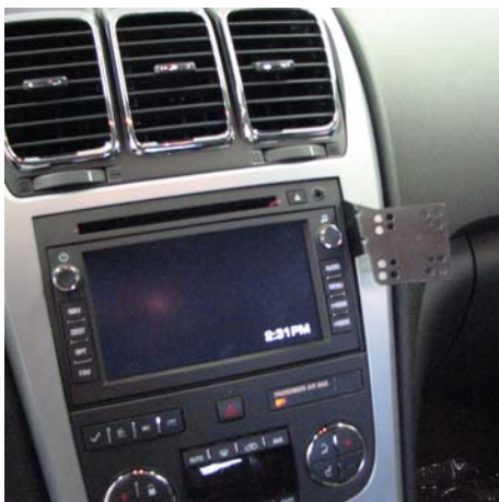
Final Installation Picture

INSTALLATION IS NOW COMPLETE. ENJOY YOUR NEW INDASH by PANAVISE MOUNT.