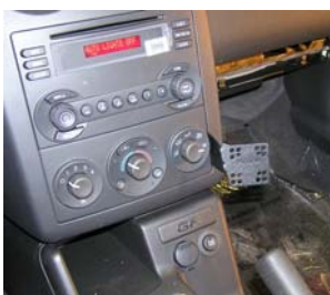
Final Installation Picture - G6