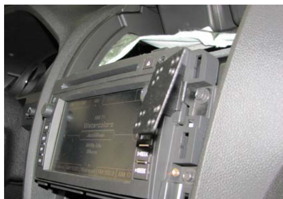
Mount in Place Showing Location