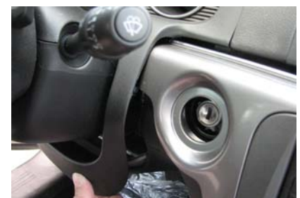
Ignition Switch Removed