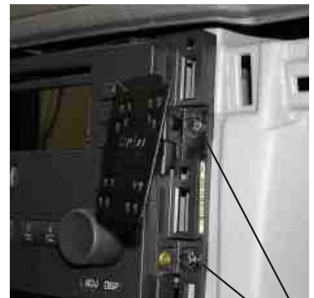
Upper Mounting Location Screw Lower Mounting Location Screw