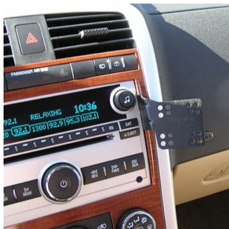
InDash installed showing upper location on new style radio.