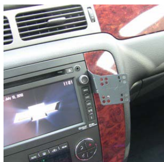
2013 Suburban, Sierra, Silverado, Tahoe, Yukon, Avalanche with new radio, mount installed.