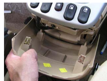
Removal of back cover

Read instructions completely prior to starting installation. All InDash Mounts are designed so that after installation, phone is facing normal driver position for left-hand drive vehicles. This mount is not designed to be used in foreign countries with right-hand drive vehicles. Use extreme care when working around the plastic components on the dash. Excess force, can cause breakage of the plastic components.