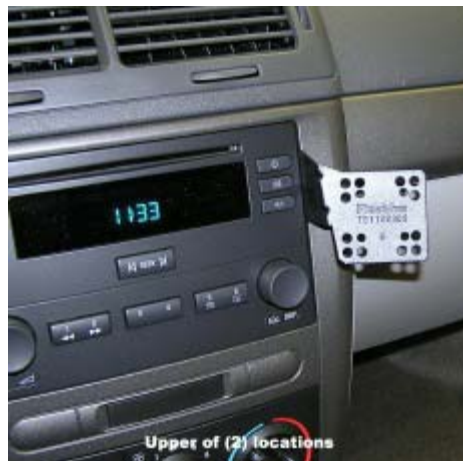
InDash Upper Mounting Location