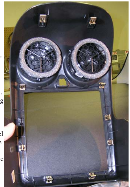
Radio bezel showing clip loca-

INSTALLATION IS NOW COMPLETE. ENJOY YOUR NEW INDASH by PANAVISE MOUNT.