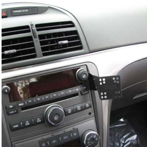
InDash Installed Showing Location