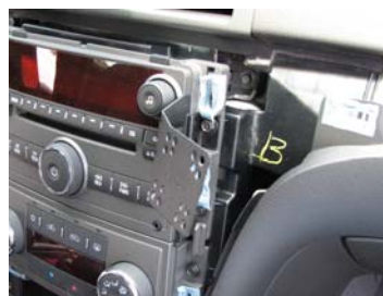
Mount in Place