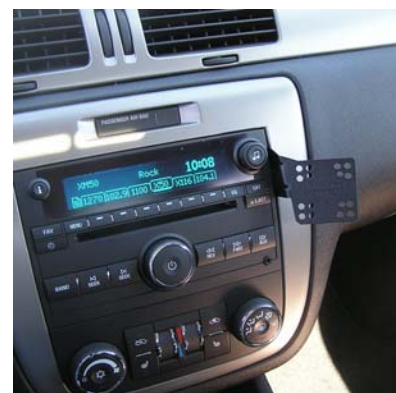
Impala, Monte Carlo Install Picture

Read instructions completely prior to starting installation. All InDash Mounts are designed so that after installation, phone is facing normal driver position for left-hand drive vehicles. This mount is not designed to be used in foreign countries with right-hand drive vehicles. Use extreme care when working around the plastic components on the dash. Excess force, can cause breakage of the plastic components.