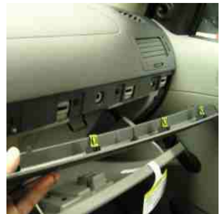
Trim Strip Removed

INSTALLATION IS NOW COMPLETE. ENJOY YOUR NEW INDASH by PANAVISE MOUNT.