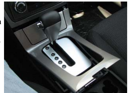
Shifter Bezel Removal