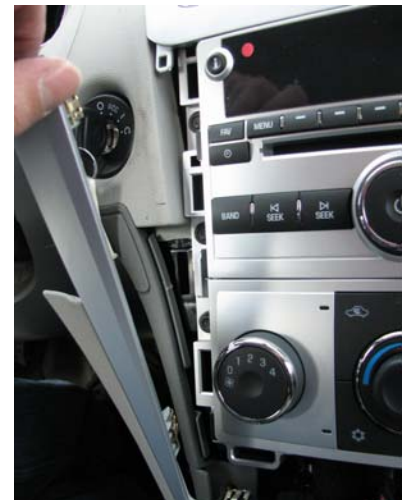
Radio Bezel Removal