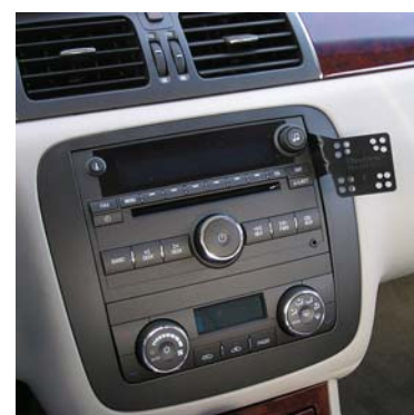
Buick Lucerne 2006 Mount Installed