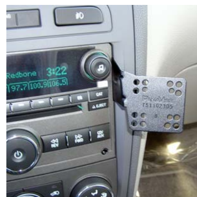
HHR Install Picture