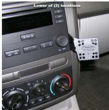
InDash Lower Mounting Location