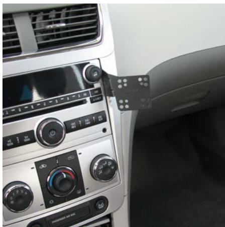
Final Installation Picture