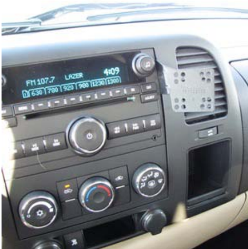
Installation of InDash Mount on Work Truck dash

INSTALLATION IS NOW COMPLETE, ENJOY YOUR NEW INDASH by NAVISE MOUNT