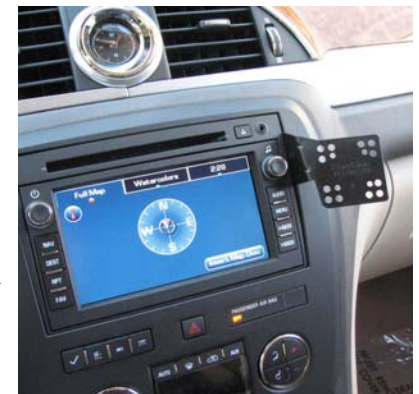
Buick Enclave Final Install Picture

INSTALLATION IS NOW COMPLETE. ENJOY YOUR NEW INDASH by PANAVISE MOUNT.