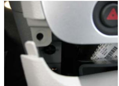
Flat Pins of Shifter Bezel

INSTALLATION IS NOW COMPLETE. ENJOY YOUR NEW INDASH by PANAVISE MOUNT