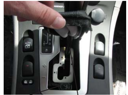
T-15 Torx Screw, T-10 Torx Screw

INSTALLATION IS NOW COMPLETE. ENJOY YOUR NEW INDASH by PANAVISE MOUNT.