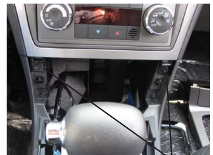
Climate Control Screws