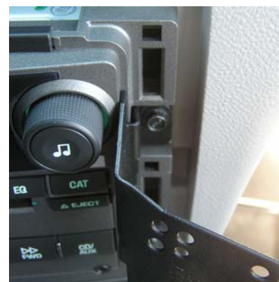
Mounting Location Picture - All