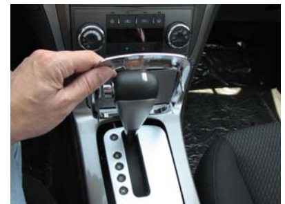
Shifter Bezel Ring Removal

INSTALLATION IS NOW COMPLETE. ENJOY YOUR NEW INDASH by PANAVISE MOUNT.