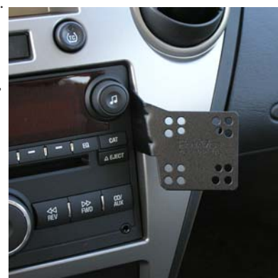
Saturn Ion Final Installation Picture