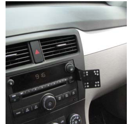
Suzuki XL-7 Final Install Picture