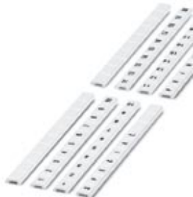
Zack marker strip flat, 10-section, horizontally labeled with the consecutive numbers: 41 ... 50, white

Please be informed that the data shown in this PDF Document is generated from our Online Catalog. Please find the complete data in the user's documentation. Our General Terms of Use for Downloads are valid ( http://phoenixcontact.com/download )