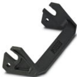
Single locking latch for B24 housing, HC-EVO...AL and HC-STA...AL

Please be informed that the data shown in this PDF Document is generated from our Online Catalog. Please find the complete data in the user's documentation. Our General Terms of Use for Downloads are valid ( http://phoenixcontact.com/download )