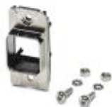
RJ45 panel mounting frame for transceiver, IP67, for push-pull interlocking, metal, for square mounting cutout, with seal and mounting screws

Panel mounting frames - FOC-V14-F1ZNI-EM/SJO - 1413981