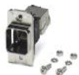
RJ45 panel mounting frame, IP67, for push-pull interlocking, metal, for rectangular mounting cutout, with seal and mounting screws, incl. RJ45 insert with IDC cable connection

Panel mounting frames - CUC-V14-F1ZNI-EM/R4F8 - 1413961