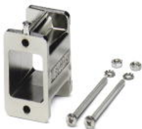
Spacer for panel mounting frames

Please be informed that the data shown in this PDF Document is generated from our Online Catalog. Please find the complete data in the user's documentation. Our General Terms of Use for Downloads are valid ( http://phoenixcontact.com/download )