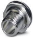
Sample set, Plug, M12, Rear mounting, M15 x 1

Sample set - SACC-BP-M-M12/M15-6-THR SP - 1421842