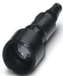
Pneumatic socket with valve, for HC-M-PN3 module, internal hose diameter of 3.0 mm

Please be informed that the data shown in this PDF Document is generated from our Online Catalog. Please find the complete data in the user's documentation. Our General Terms of Use for Downloads are valid ( http://phoenixcontact.com/download )