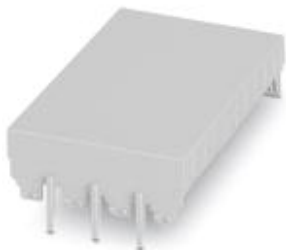
DIN rail housing, 10U, Housing cover, width: 75.87 mm, height: 109.8 mm, depth: 26 mm, color: light gray (7035)

Please be informed that the data shown in this PDF Document is generated from our Online Catalog. Please find the complete data in the user's documentation. Our General Terms of Use for Downloads are valid ( http://phoenixcontact.com/download )