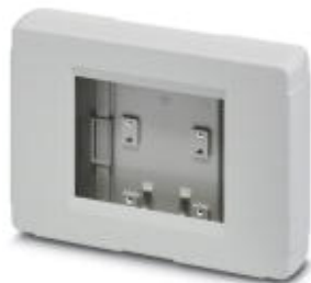
Display housing, 5.7", light gray, central window, front level, for battery pack consisting of two half shells, with screws and battery pack contacts

Please be informed that the data shown in this PDF Document is generated from our Online Catalog. Please find the complete data in the user's documentation. Our General Terms of Use for Downloads are valid ( http://phoenixcontact.com/download )