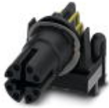
CAT6 A contact carrier, Ethernet, 8-pos., rear mounting, with angled solder connection

Flush-type connector - SACC-CI-M12FSX-8CON-L90 - 1424180