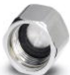
M12 metal sealing cap for unoccupied M12 plugs of the sensor/actuator cable, flush-type plugs and I/O devices in the field