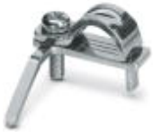
Shield connection clamp for printed circuit terminal block

Shield connection clamp - ME-SAS - 2853899