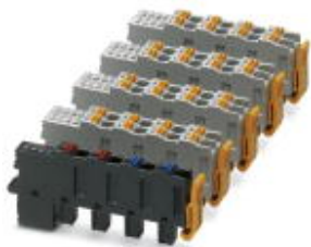
Axioline F connector set (for e.g., AXL F A18 1F, AXL F AO8 1F)

Please be informed that the data shown in this PDF Document is generated from our Online Catalog. Please find the complete data in the user's documentation. Our General Terms of Use for Downloads are valid ( http://phoenixcontact.com/download )