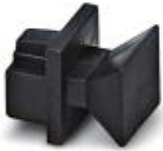
Dust protection caps for RJ45 socket

Dust protection - FL RJ45 PROTECT CAP - 2832991