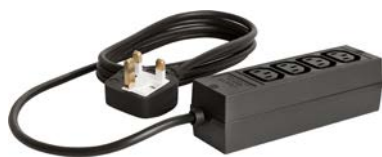
with UK power supply cord