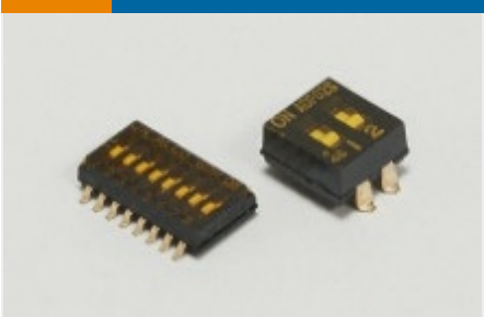
DIP & SIP Switches (122)