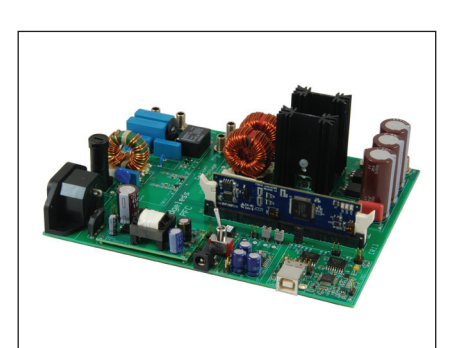
🔺 Bridgeless PFC

loading a development environment, further reducing start up time. All four kits are supported in the controISUITE<sup>™</sup> software system developed for C2000<sup>™</sup> MCUs to signifigantly reduce development time allowing designers to focus on product differentiators rather than basics, controlSUITE software includes unique, optimized libraries for the C2000 devices including building blocks and drivers for digital power supply designs. These kits also include an isolated JTAG via integrated USB interface integrated, eliminating the requirement of an external emulator, reducing development costs. The Piccolo F28027* controlCARD