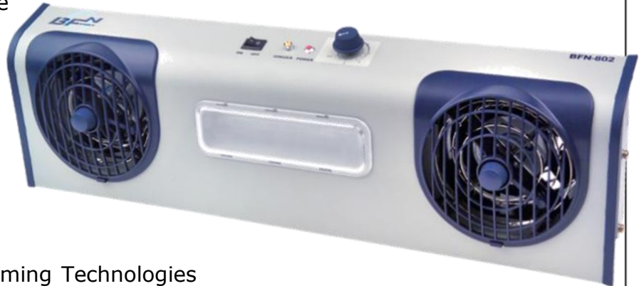
Model BFN 802 AC Overhead Ionizer

BFN series AC ionizers from Transforming Technologies create a dense and well-balanced ionization current. They are unique in their ability to deliver fast decay times with low offset voltages. Continuous balance and decay protection is assured by the reliable, stable AC design. An integrated emitter point cleaner, removable front and rear fan guards, safety switch combine to make the BFN 802 an effective, user friendly ionizer.