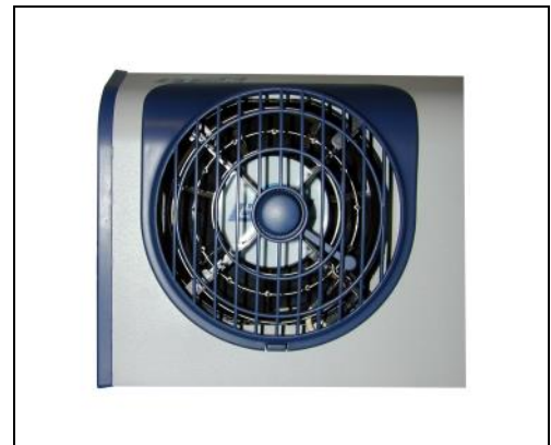
Removable fan plate with safety switch and point cleaner.