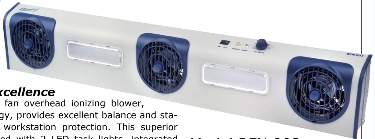
Model BFN 803 AC Overhead Ionizer